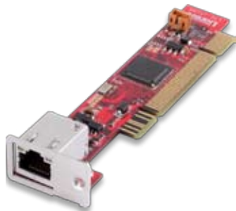
1U Ultra Low Profile Bracket